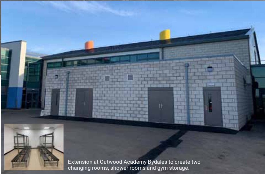
Extension at Outwood Academy Bydales to create two changing rooms, shower rooms and gym storage.