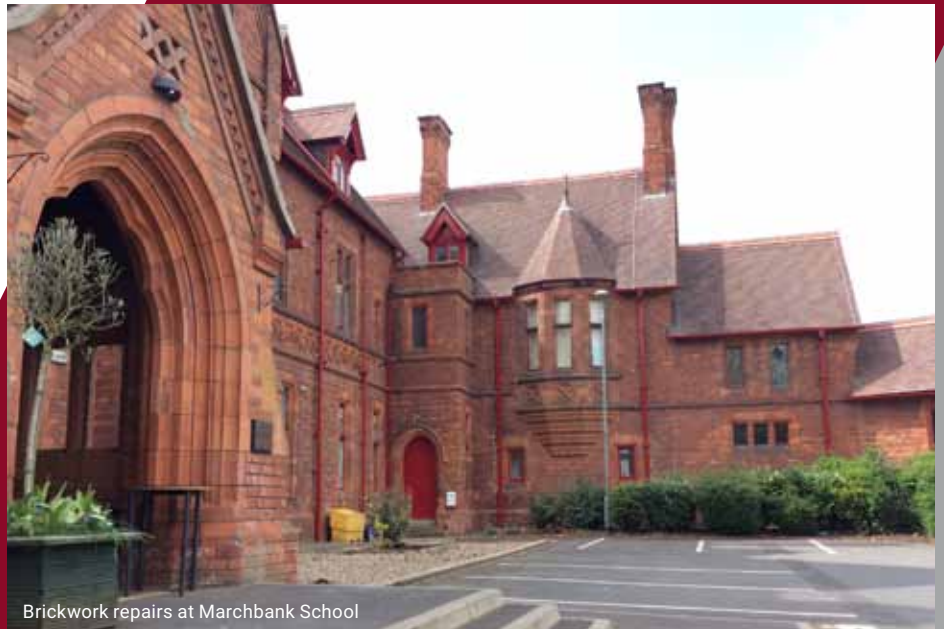
Brickwork repairs at Marchbank School